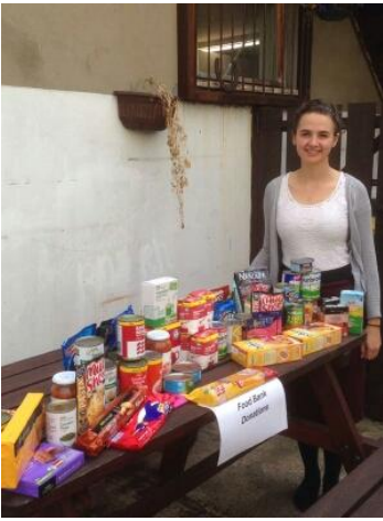
Skills 4 Communities food collection